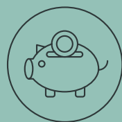
Financial Lines Reinsurance