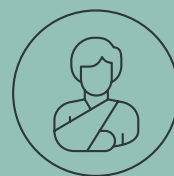
Accident & Health Insurance